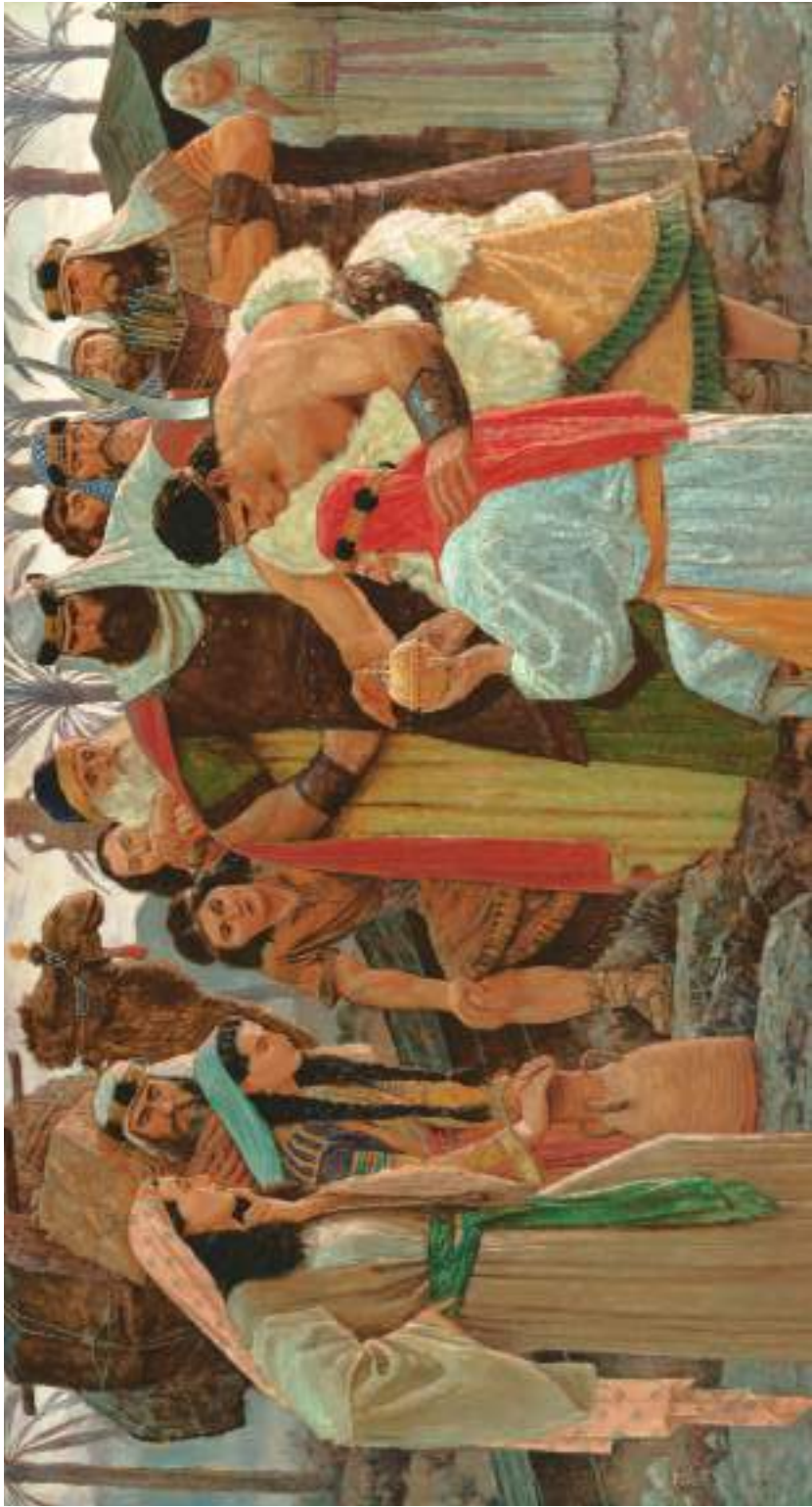
Lehi discovers the Liahona