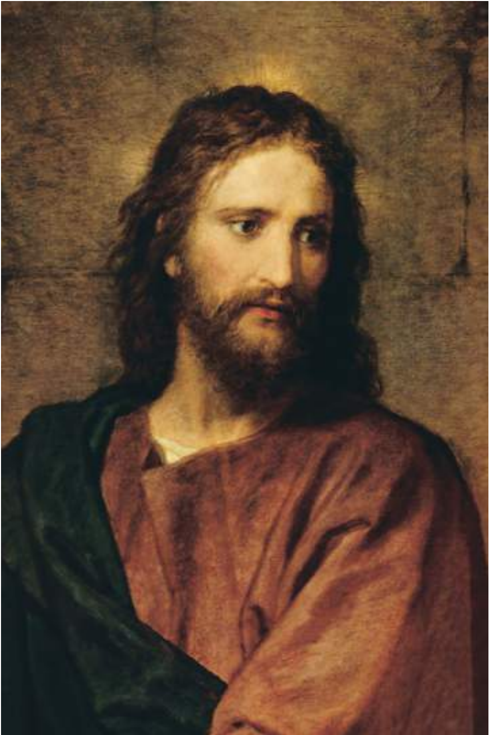
The Lord Jesus Christ Painting by Heinrich Hofmann