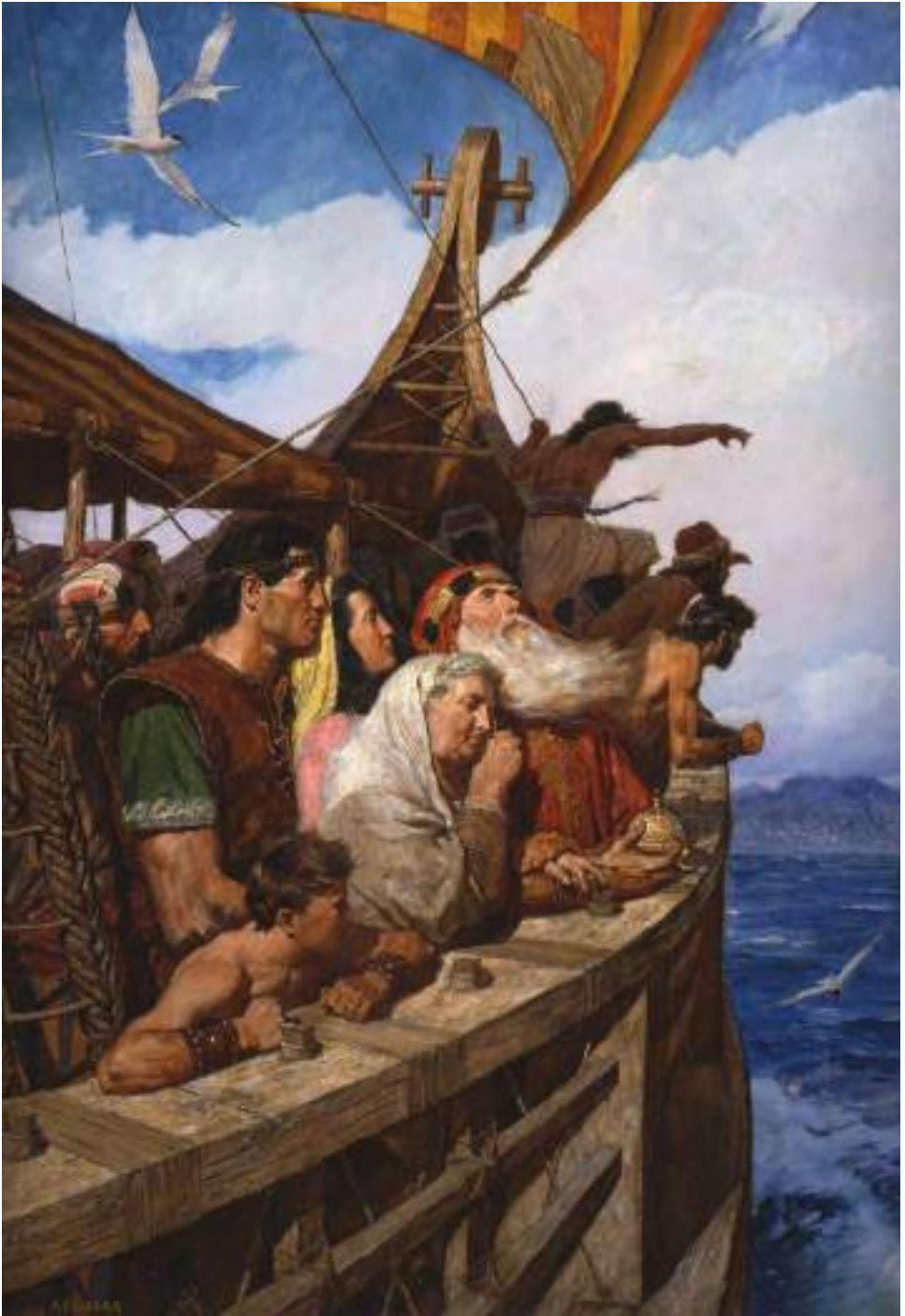
Lehi and his people arrive in the promised land Painting by Arnold Friberg