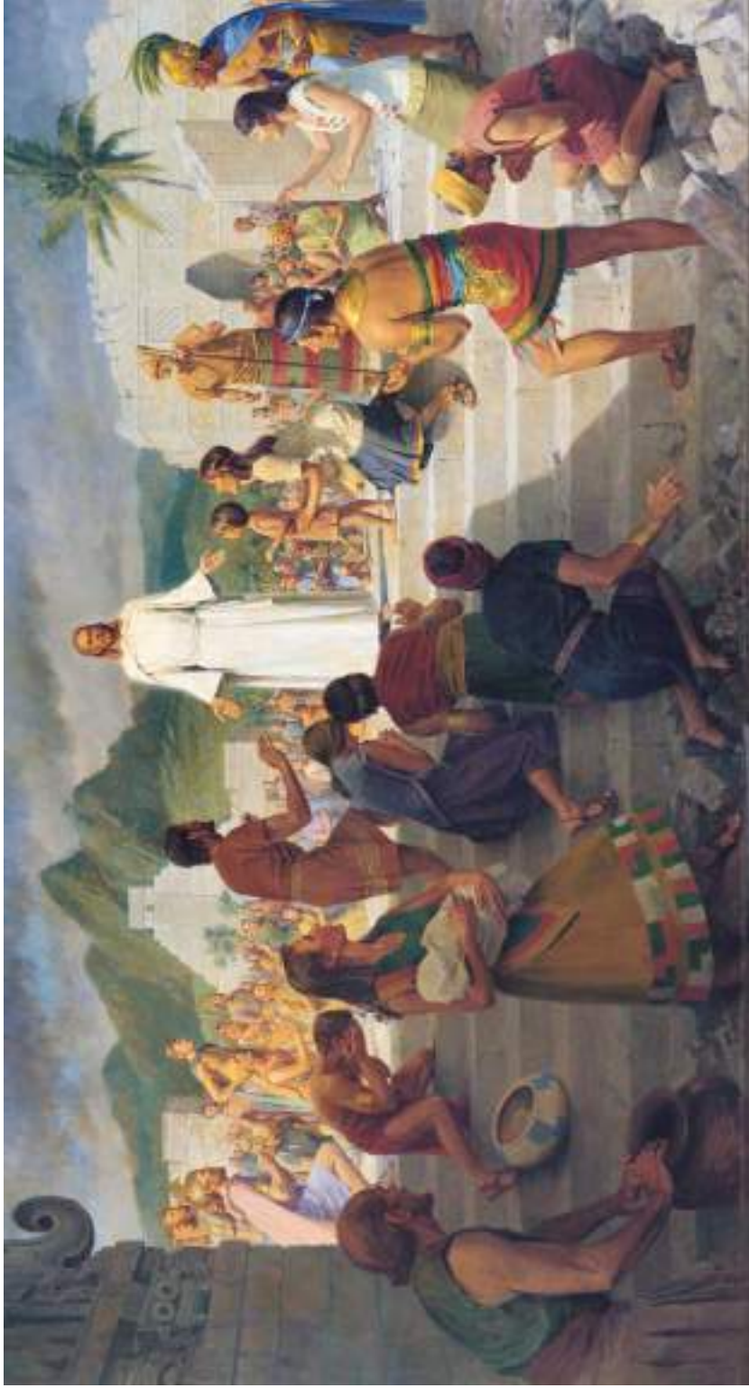
Jesus Christ visits the Americas